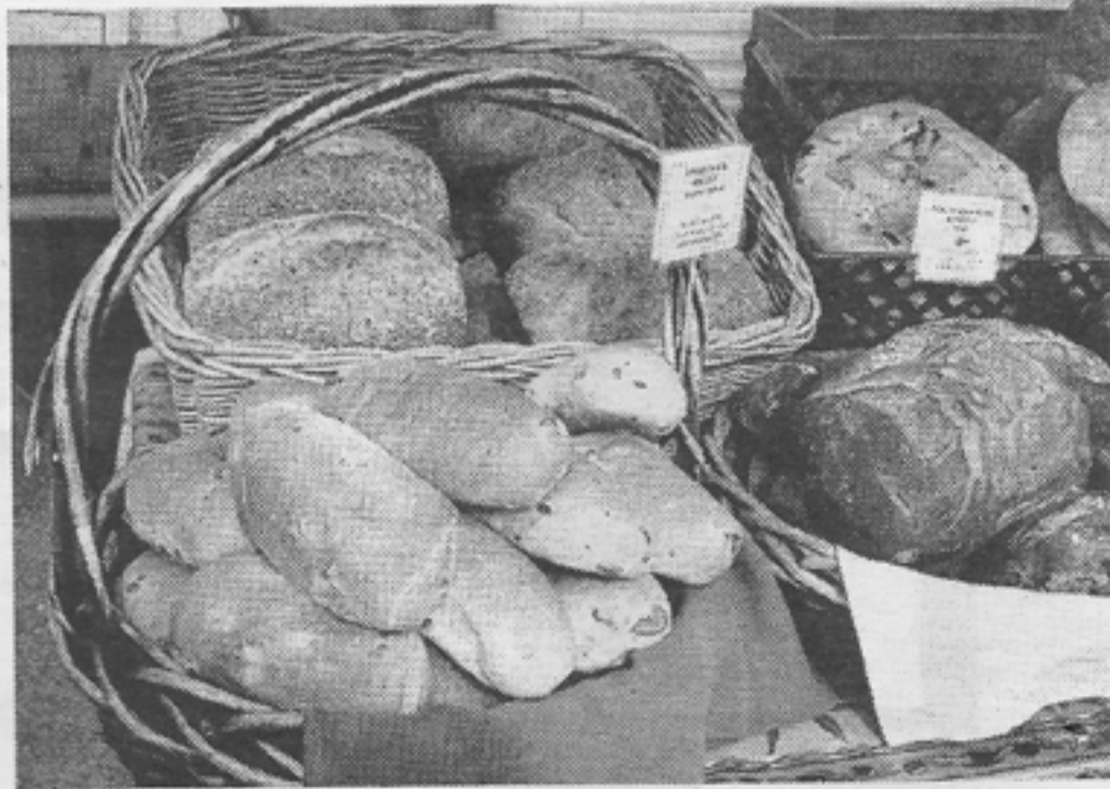
LOAFING AROUND: Get artisan bread for less dough at SoWa Food and Produce Market.

SoWa Open Market, SoWa Antiques Market and SoWa Food and Produce Market, 500-540 Harrison Ave. (South End), Saturday and Sunday, 10 a.m.-4 p.m.; Sundays through Oct. 25, 10 a.m.-4 p.m. sowaopenmarket.com or sowasundays.com . Parking at 365 and 500 Albany St. and 38 Wareham St. Admission is free.